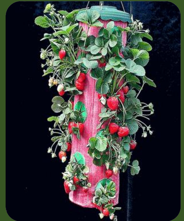
Figure 1: Hanging Bag Growing Strawberries